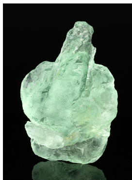
Fluorite - Belgium