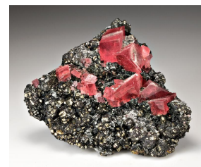
Rhodochrosite - Colorado