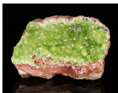
Smithsonite - Guchab, Namibia

You can find these by clicking on the Auction Link on our Home Page.